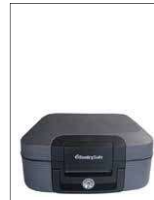
Fig. ZFX - SS20101