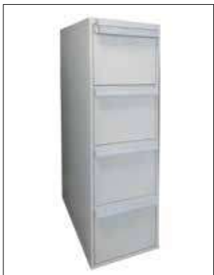
Fig. ZFH - F-31-4-60