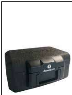
Fig. ZFX - SS1210