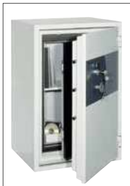
Fig. e.g. PK420Media