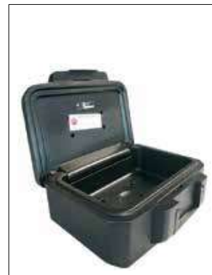
Fig. ZFX - SS1210