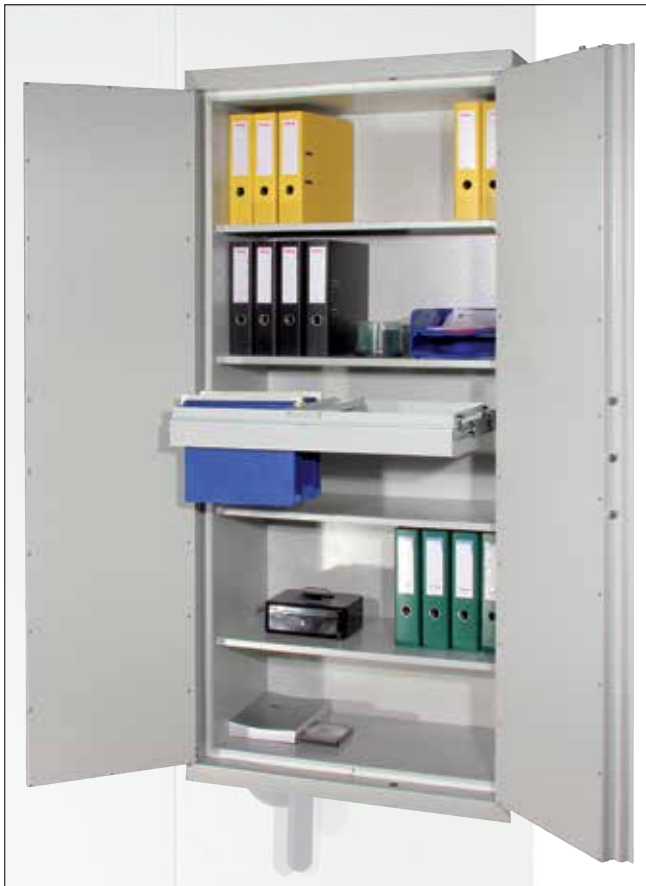
Fig. ZFA - L90D