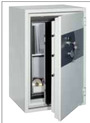
Fig. ZFD - PK420Media