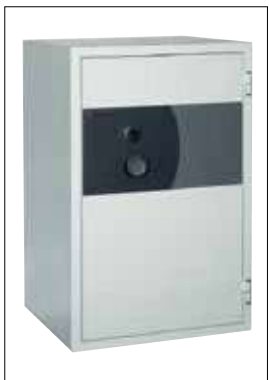
Fig. e.g. PK420Media