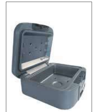
Fig. ZFX - SS20101