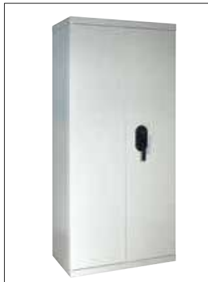
Fig. ZFA - L90D