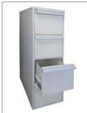
Fig. ZFH - F-31-4-60