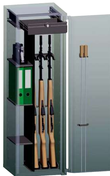
Fig. Gun safe equipment WT3