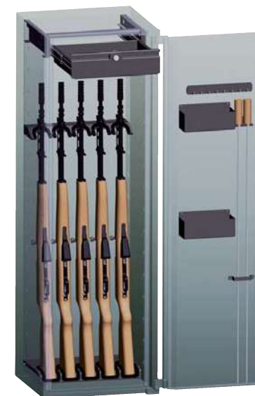
Fig. Gun safe equipment WT5