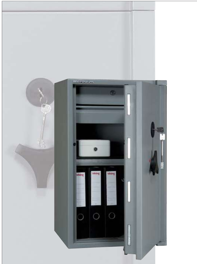
Fig. Safe BG20, hinge right K-Lock Cawi 2 keys (95 mm), 1 lockable drawer, 1 drawer, 1 shelf